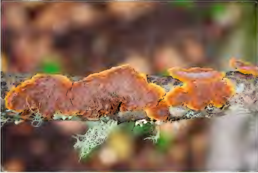
FIG. 1. Fruitbody of Hymenochaete megaspora (He 302, paratype).

narrow lumen, occasionally septate, rarely branched, regularly arranged, more or less interwoven, 2–4 \mu\text{m} in diam.